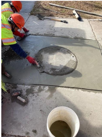
Crew restoring the sidewalk around the manhole at 915 Whitlock Rd

For upcoming work, more manholes will be located and investigated.