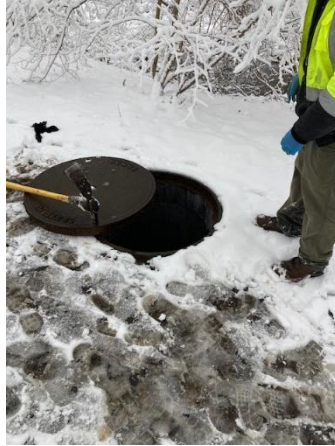
Manhole at 305 Wilmslow Rd located

We hope this provides insights for the work status as we strive to timely and safely complete this project. If you have any questions, please call (410) 396-4700, Monday through Friday, between 8:30 AM and 4:30 PM. Additional information and resources are also available on our website https://publicworks.baltimorecity.gov/ .