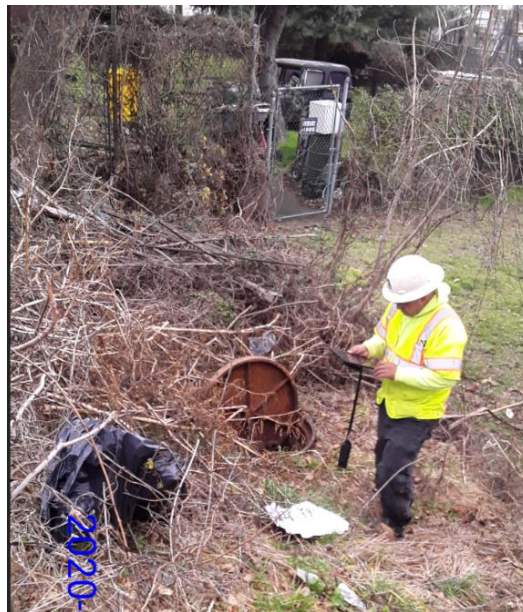
Manhole at located at 5906 Burgess Ave.

For upcoming work, more manholes will be located and investigated.