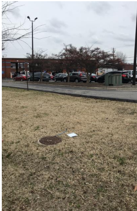
Manhole at 6830 Ridgeview Ave located

We hope this provides insights for the work status as we strive to timely and safely complete this project. If you have any questions, please call (410) 396-4700, Monday through Friday, between 8:30 AM and 4:30 PM. Additional information and resources are also available on our website https://publicworks.baltimorecity.gov/ .