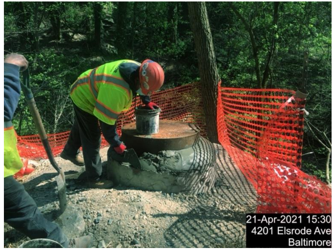
21-Apr-2021 15:30 4201 Elsrode Ave Baltimore

We hope this provides insights for upcoming work as we strive to timely and safely complete this project. If you have any questions, please call (410) 396-4700, Monday through Friday, between 8:30 AM and 4:30 PM. Additional information and resources are also available on our website https://publicworks.baltimorecity.gov/ .