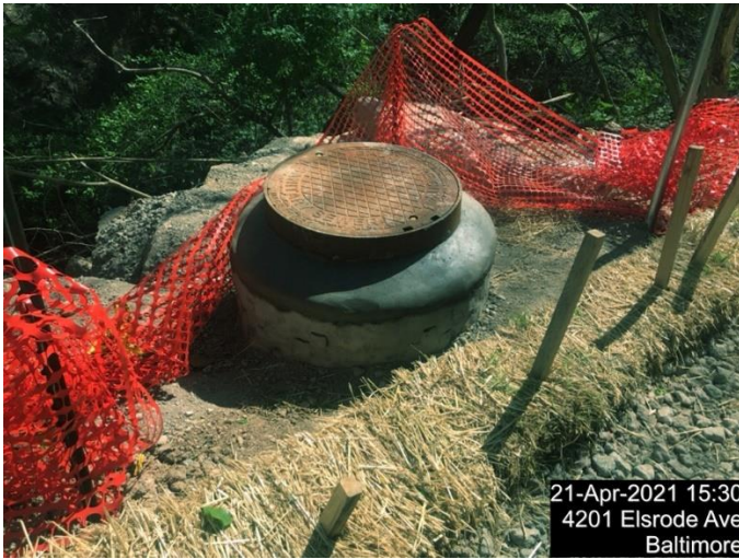
21-Apr-2021 15:30 4201 Elsrode Ave Baltimore