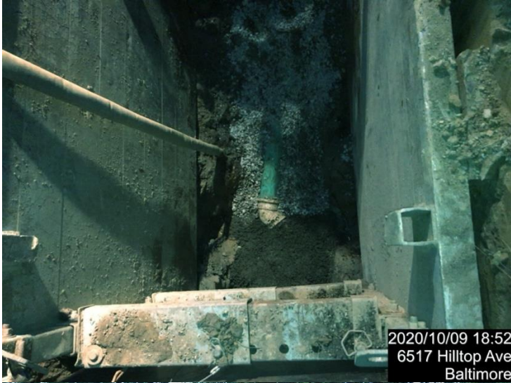
2020/10/09 18:52 6517 Hilltop Ave Baltimore