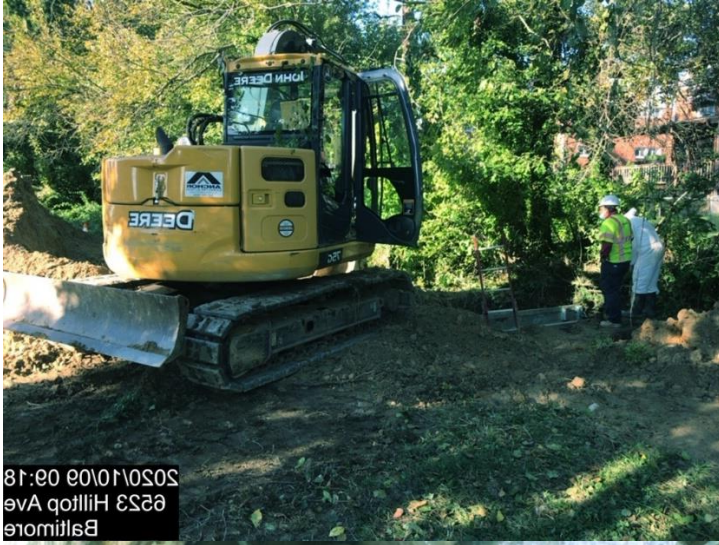
2020/10/09 09:18 6523 Hilltop Ave Baltimore