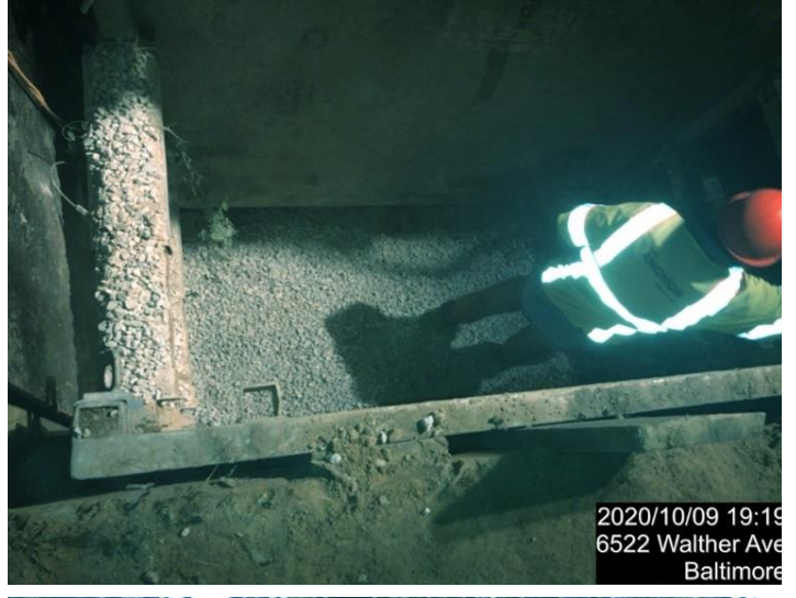
2020/10/09 19:19 6522 Walther Ave Baltimore