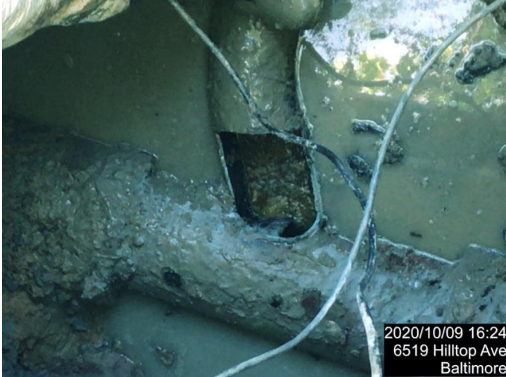
2020/10/09 16:24 6519 Hilltop Ave Baltimore