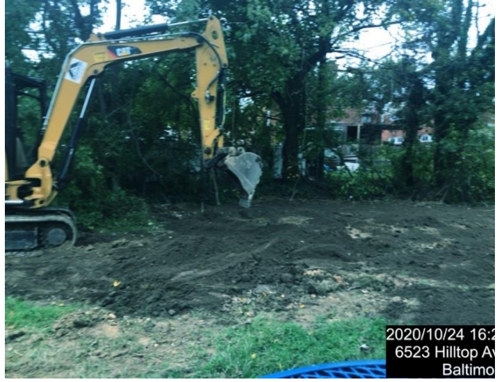
2020/10/24 16:2 6523 Hilltop Ave Baltimore