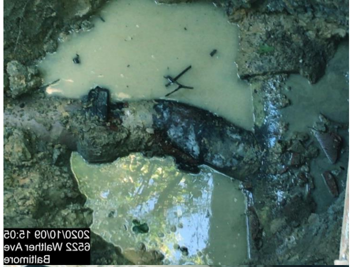
2020/10/09 15:05 6523 Walther Ave Baltimore