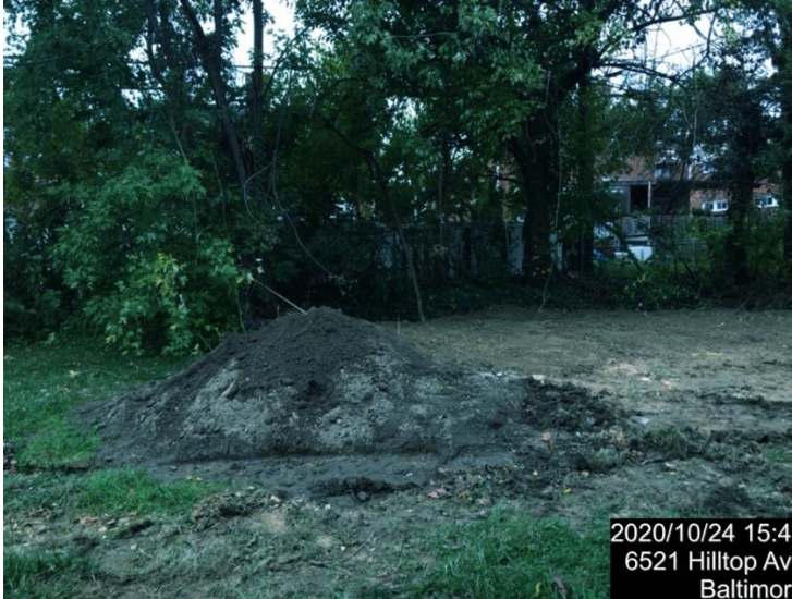
2020/10/24 15:4 6521 Hilltop Ave Baltimore