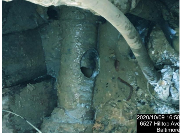
2020/10/09 16:58 6527 Hilltop Ave Baltimore