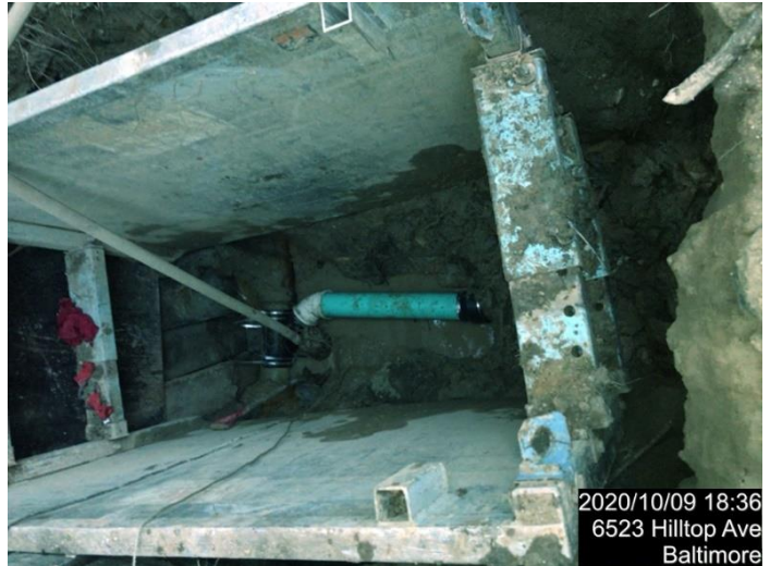
2020/10/09 18:36 6523 Hilltop Ave Baltimore