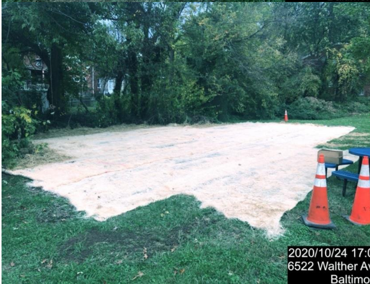
2020/10/24 17:0 6522 Walther Ave Baltimore