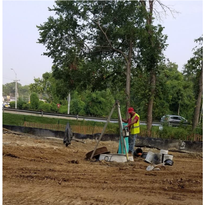
Parging Pipe Joints at Manhole