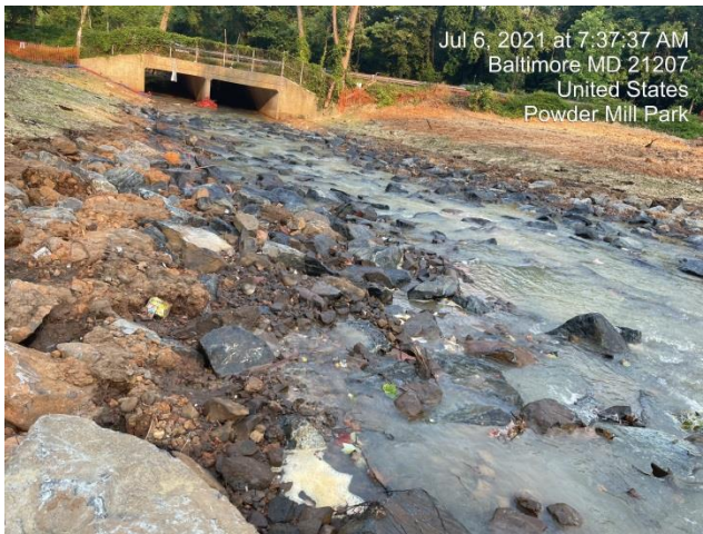
Stream Flow over Rip Rap Ramp