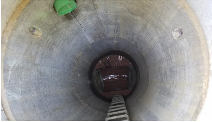
Brick Channel in Manhole MH-28

Below are some pictures to highlight work ongoing.