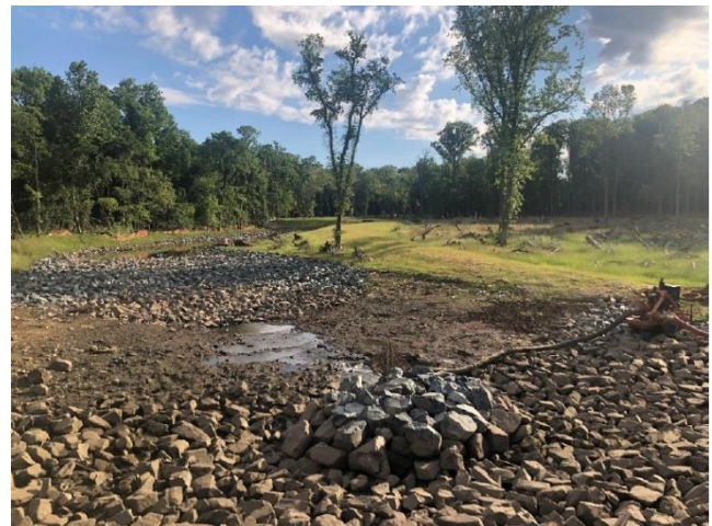
View of Stream looking North