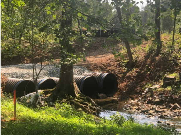
Temporary Access Culvert

Below are some pictures to highlight work accomplished to-date.