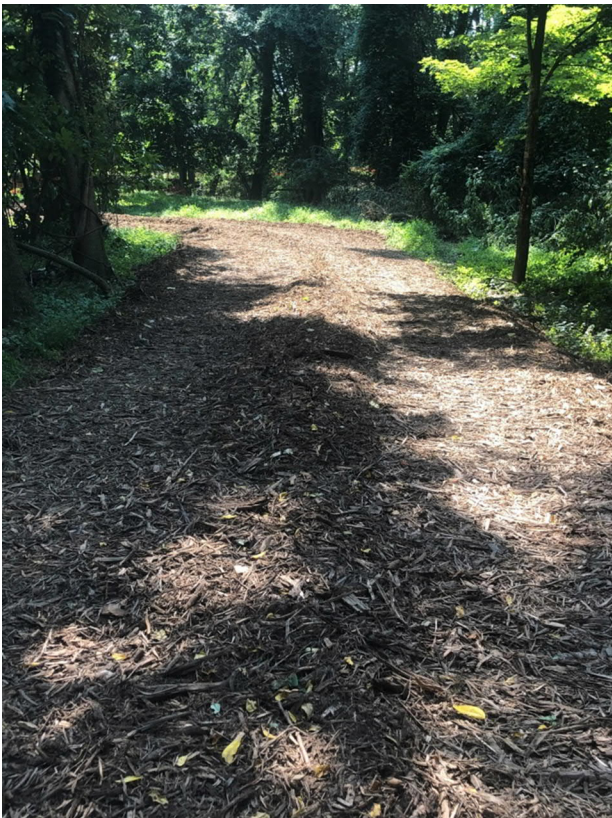
Mulch Access Road for Stream Work