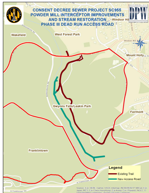
Figure 2: SC955 Phase III – Leakin Park