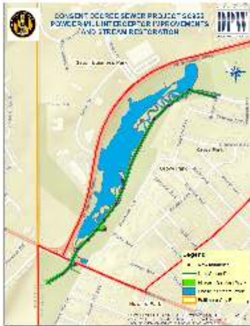
Figure 1: SC955 Phase I & II – Powder Mill Park