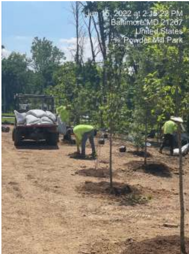
Planting in Powder Mill Park

Below are some pictures to highlight work completed in Powder Mill Park (Phases I & II) & Leakin Park (Phase III)