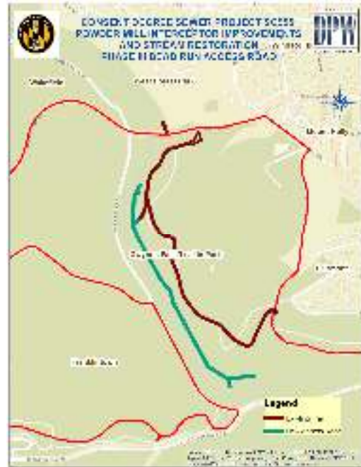
Figure 2: SC955 Phase III – Leakin Park