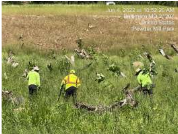
Planting in Powder Mill Park