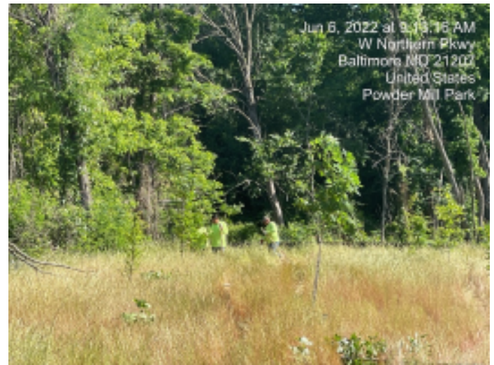
Planting in Powder Mill Park