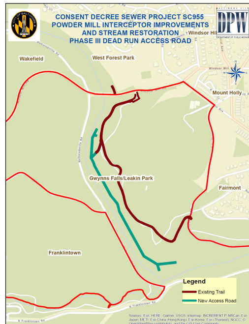
Figure 2: SC955 Phase III – Leakin Park