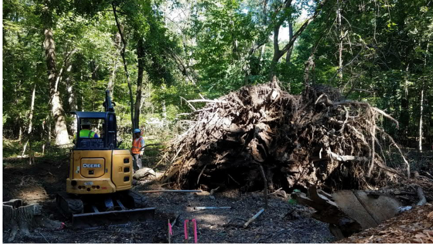
Establishing LOD & Brush Removal in Powder Mill Park

Below are some pictures to highlight work accomplished to-date.