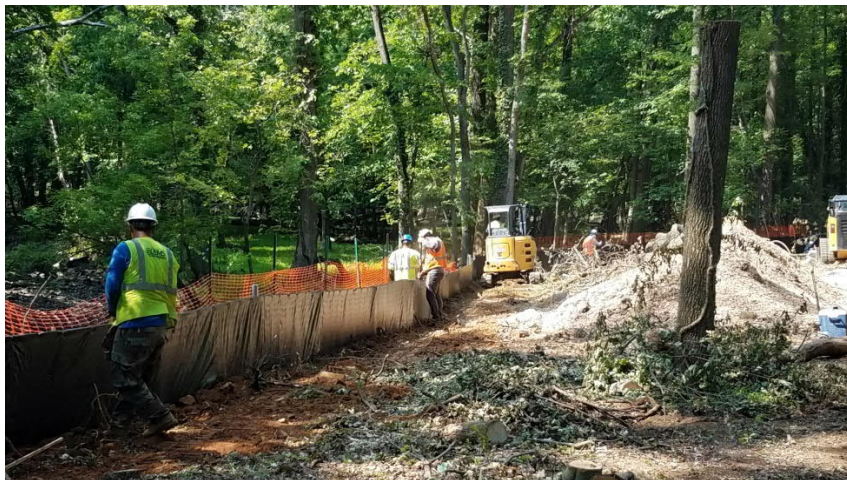
Installation of Erosion and Sediment Control Devices