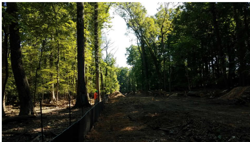
Installation of Tree Protection Fencing