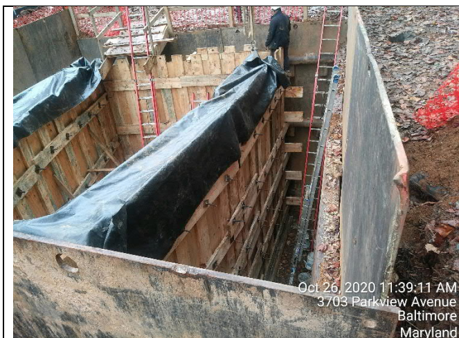
Poured Base Slab and Walls of Junction Chamber

Below are some pictures to highlight work ongoing.