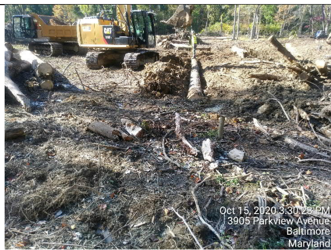
Phase II Streamwork