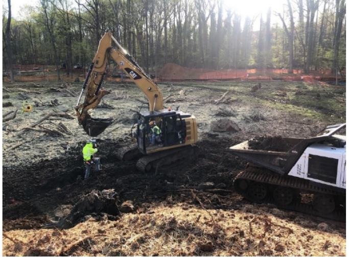
Verifying Elevations of Log Features