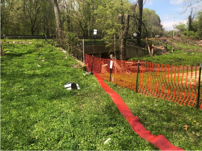
Pumparound Discharge to Culvert

Below are some pictures to highlight work ongoing.