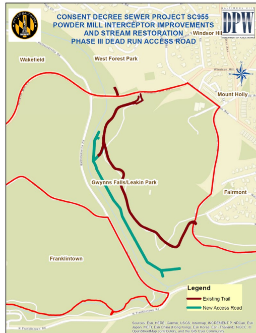
Figure 2: SC955 Phase III – Leakin Park