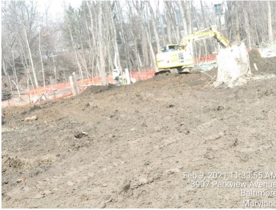
Stream Restoration – Filling Old Stream Bed

Below are some pictures to highlight work ongoing.