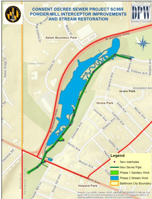
Figure 1: SC955 Phase I & II – Powder Mill Park