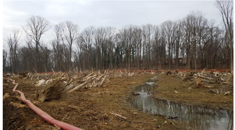
Woody Debris in Stream Floodplain