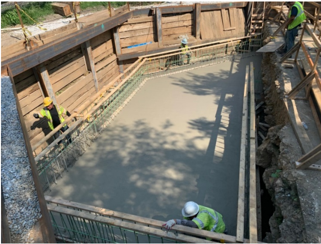
Bottom slab for Structure B poured