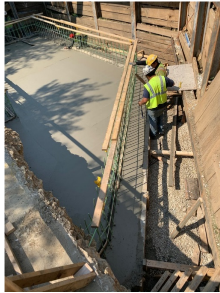
Bottom slab for Structure B poured