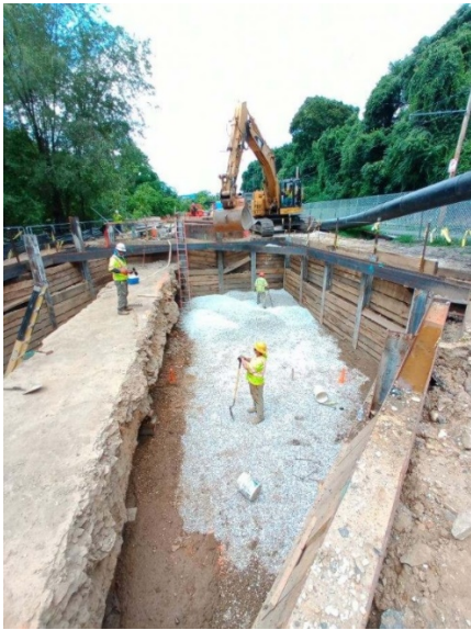
Base for bottom slab of Confluence Structure B