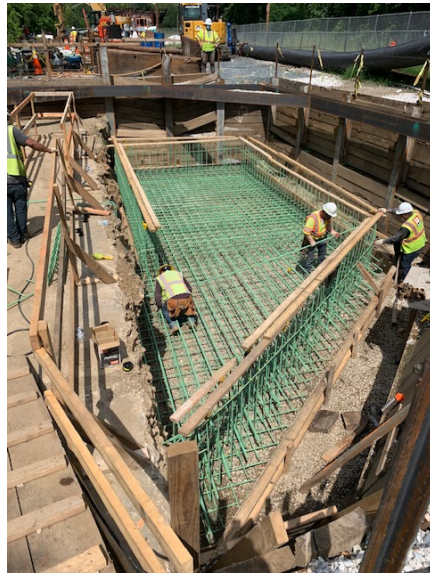
Reinforcement for bottom slab of Confluence Structure B