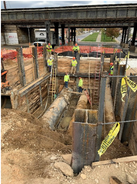
Broadway Vault 1 Excavation