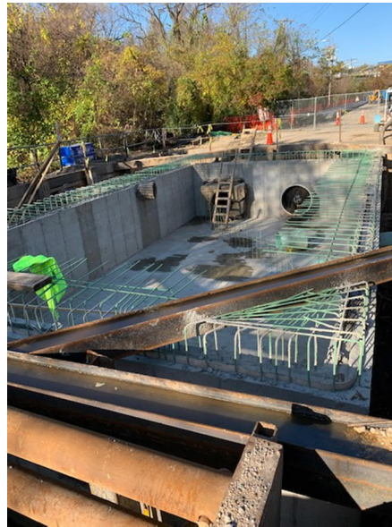
Falls Rd Bypass Pumping, Structure A