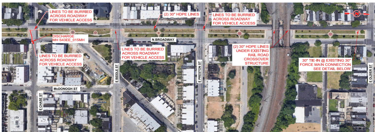
Below are some pictures to highlight work accomplished to-date.