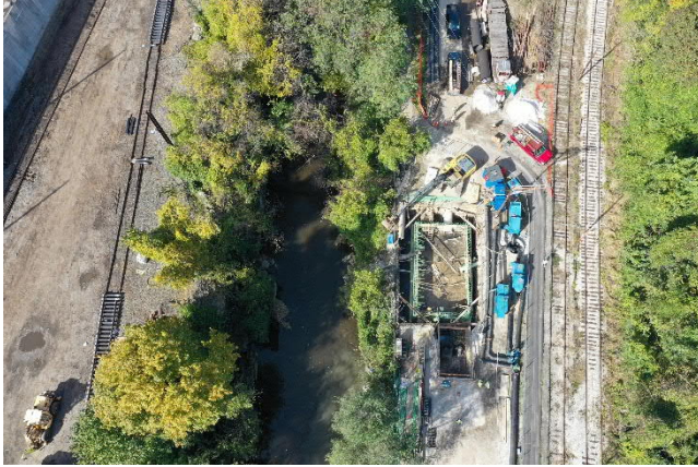
Falls Rd Bypass Pumping, Structure A