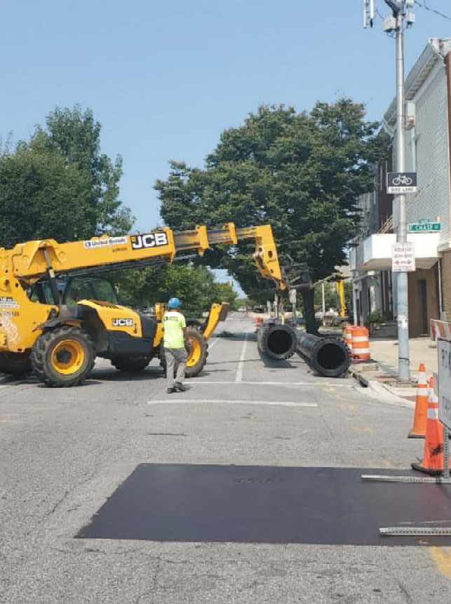
Bypass Pipe Placement, Chase St