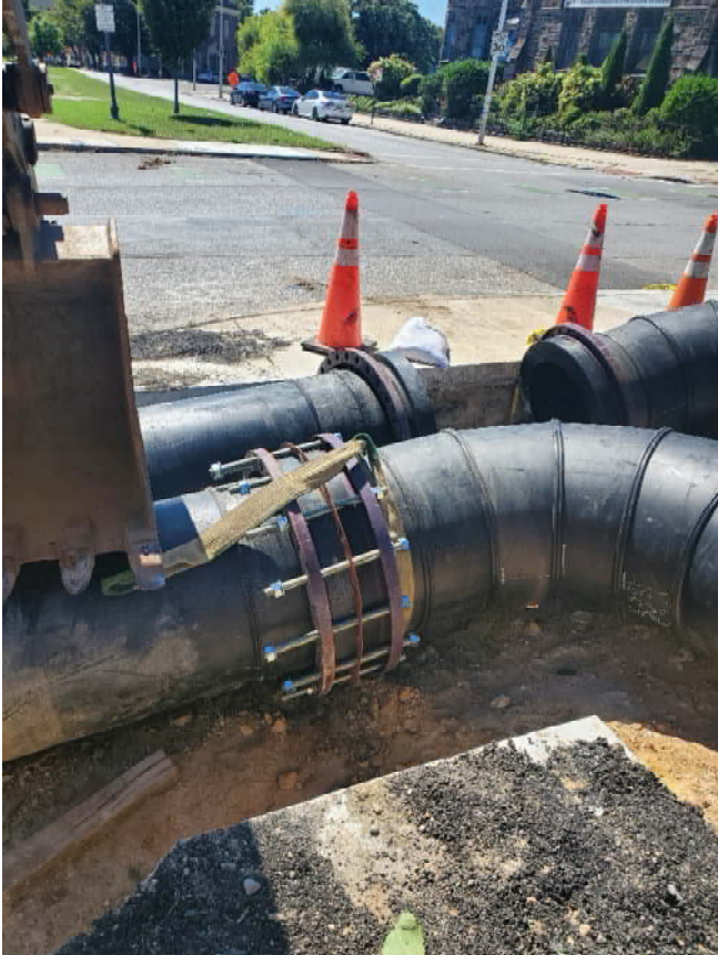
Bypass Pipe Placement, N Broadway (Biddle St)