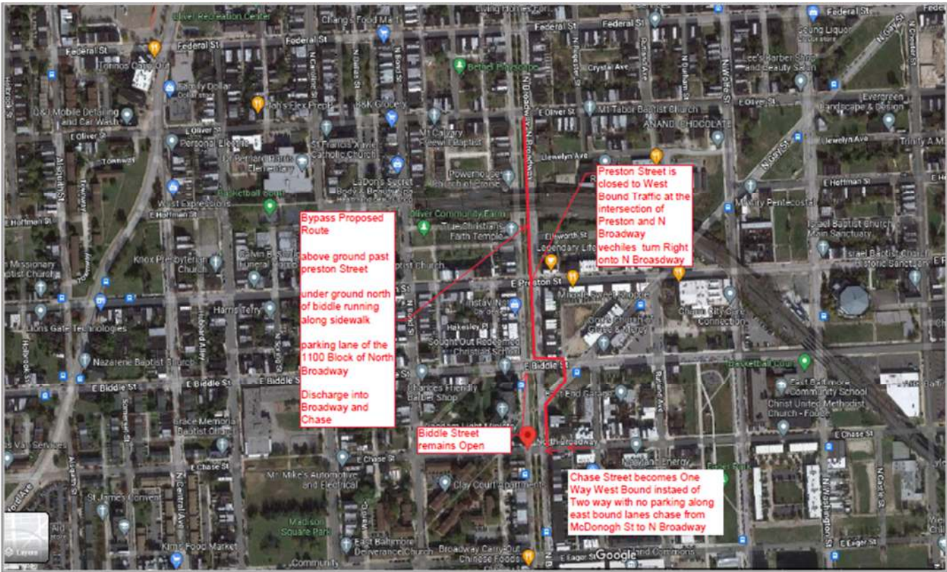
Figure 1, N. Broadway Bypass Layout