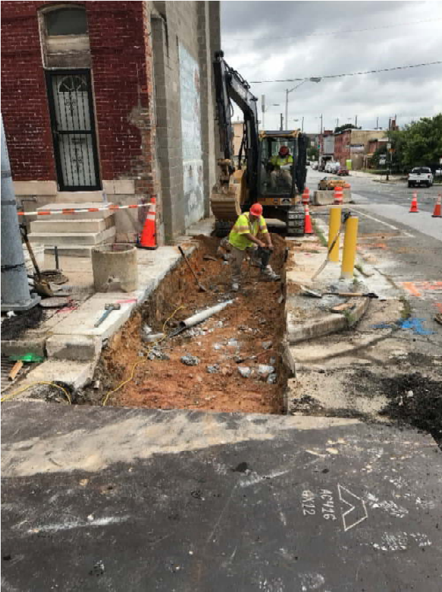
Sewer Repair, Ellsworth St