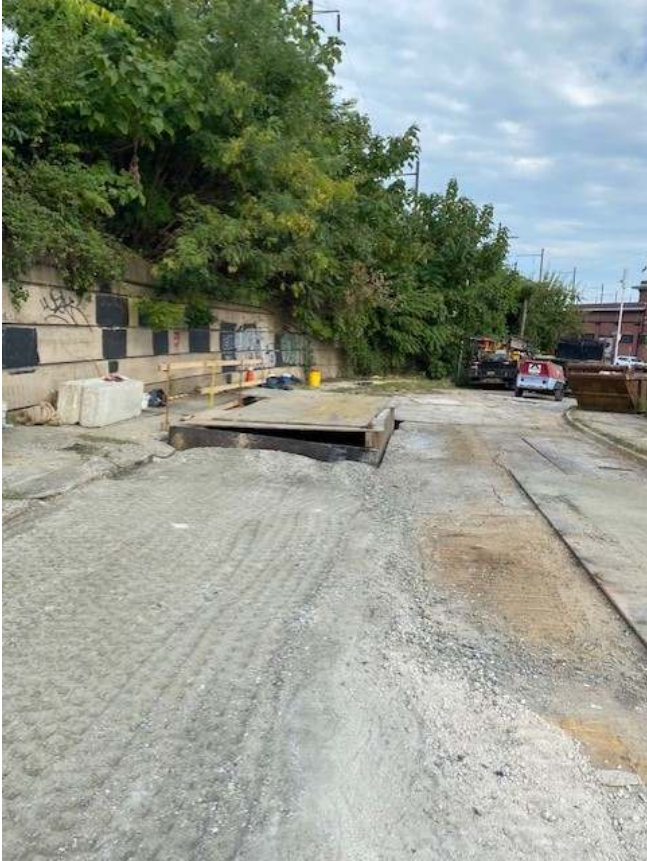
Backfill and Compaction, Ellsworth St