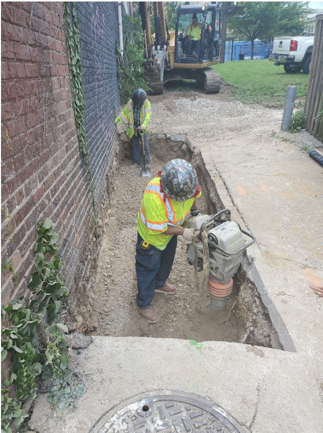
Pipe Replacement, St Paul St