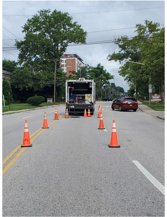
CCTV & Cleaning, Park Heights Ave