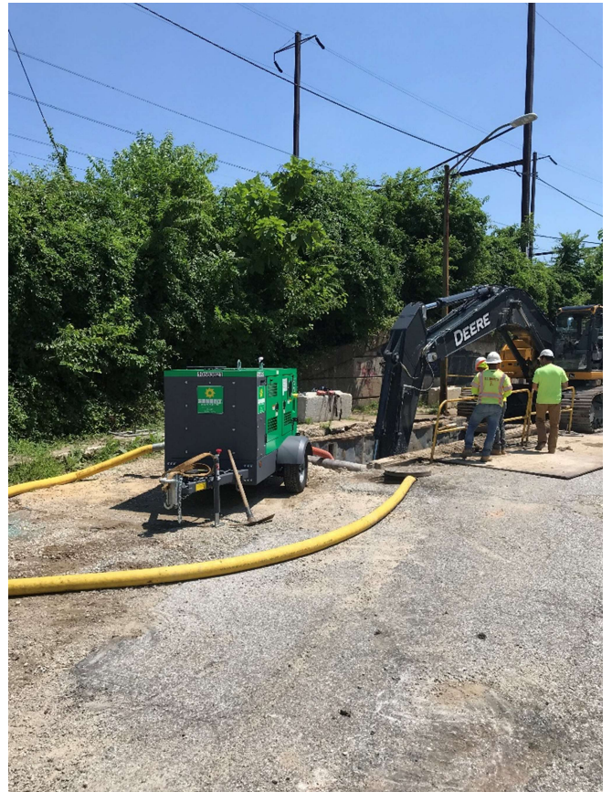
Trench Dewatering, Rutland Ave