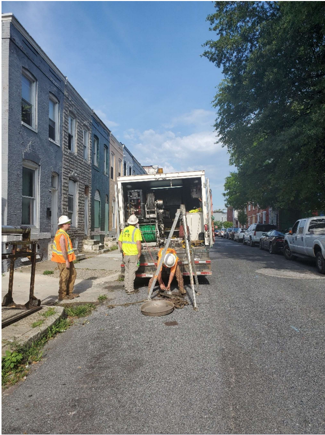
CIPP Lining, Barclay & 27th