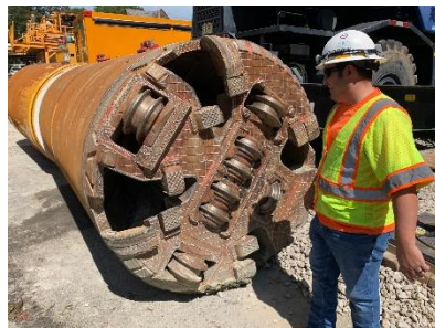
60" tunnel boring machine at 3500 Wabash Avenue