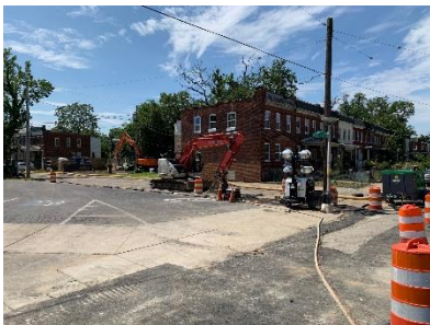
Open-cut sewer work completed at Ridgewood Ave & Reisterstown Road