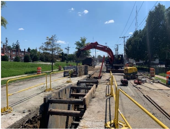
New 30" sewer pipe construction along Reisterstown Road

Below are some pictures to highlight work accomplished to-date.