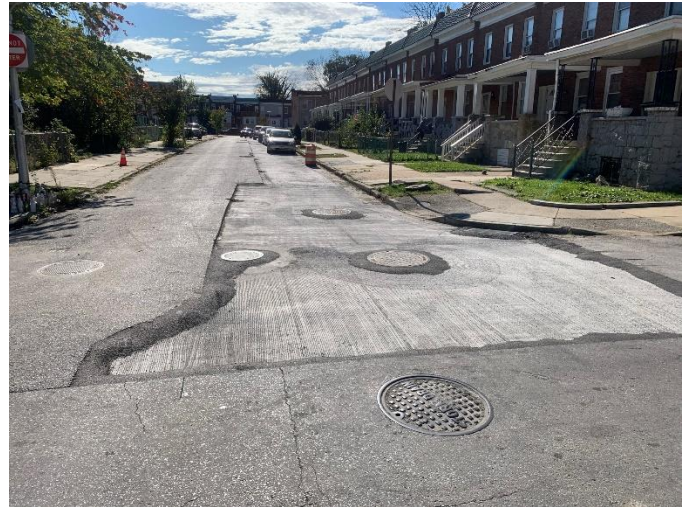
Ongoing restoration at Queensberry Ave