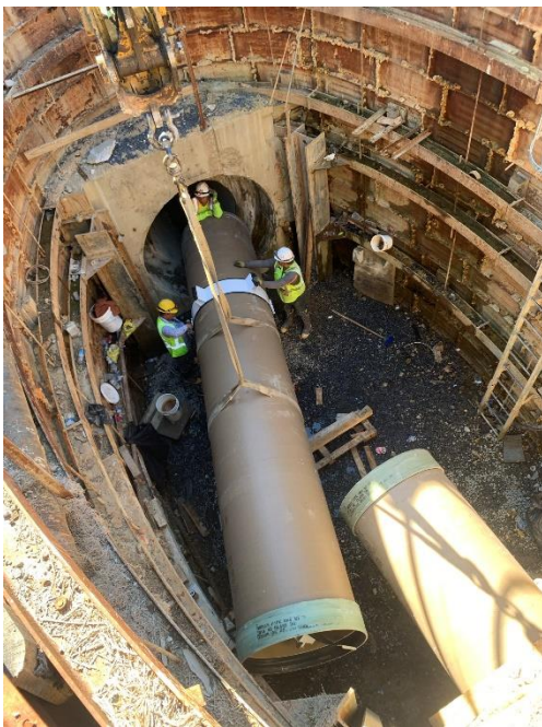
Slip-lining on Wabash Avenue