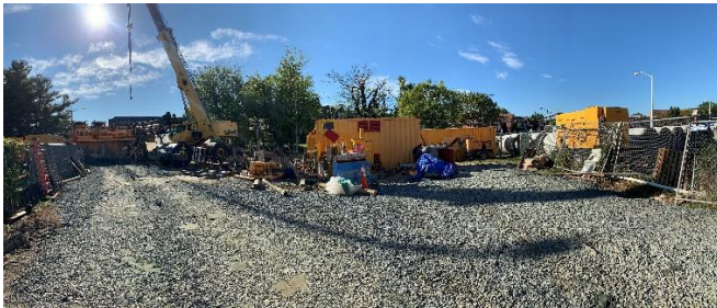
60" microtunneling underway at the MTA lot at Wabash Avenue

Below are some pictures to highlight work in-progress and recently accomplished: