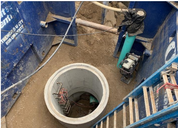
Manhole construction underway @ Towanda Ave. & W Cold Spring Ln.

Below are some pictures to highlight work accomplished to-date.