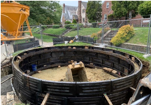
Tunneling shaft construction along Wabash Ave.