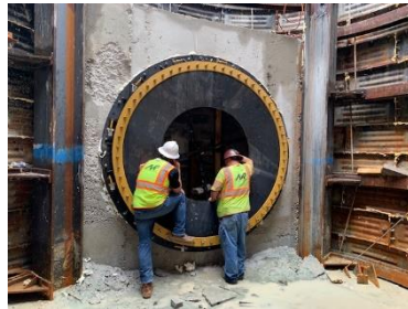
Shaft #2 prior to tunnel boring breakthrough