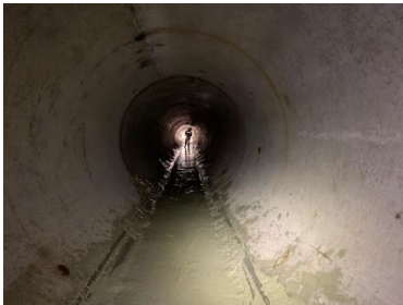
Preliminary view of new 60" casing from Dukeland to Wabash Ave. The 42" carrier pipe will be installed after which will convey flow.