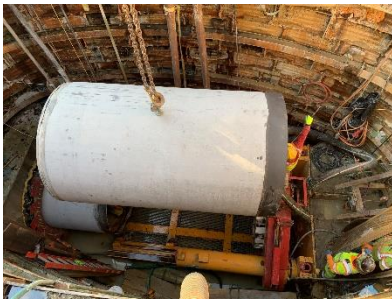
Tunneling in-progress along 3400 Wabash Ave