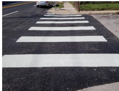
New crosswalk along the 4600 Block of Reisterstown Road