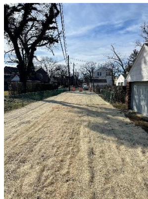
Temporary stabilization after sewer construction at 3800 Blk of Belle Ave (Grass Alley)

We hope this provides insights for upcoming work as we strive to timely and safely complete this project. If you have any questions, please call (410) 396-4700, Monday through Friday, between 8:30 AM and 4:30 PM. Additional information and resources are also available on our website https://publicworks.baltimorecity.gov/ .