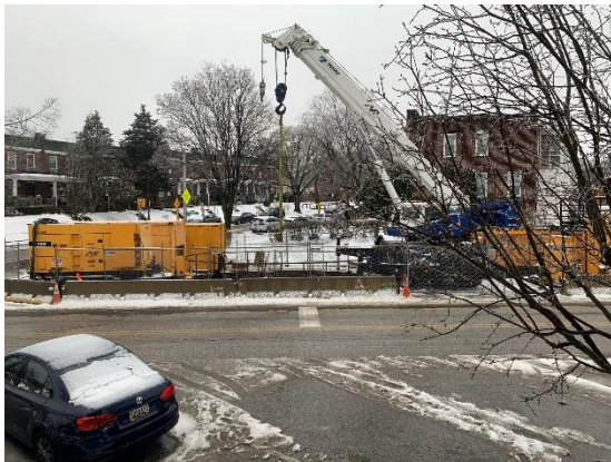
Microtunneling underway at Wabash Ave & Sequoia Avenue

Below are some pictures to highlight work in-progress and recently accomplished: