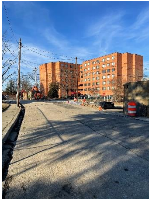
Sewer replacement work location at 3900 Blk of Callaway Avenue