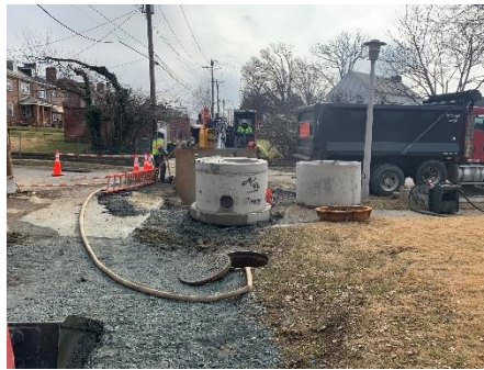
Sewer construction at 3800 Blk Grantley Ave underway

We hope this provides insights for upcoming work as we strive to timely and safely complete this project. If you have any questions, please call (410) 396-4700, Monday through Friday, between 8:30 AM and 4:30 PM. Additional information and resources are also available on our website https://publicworks.baltimorecity.gov/ .