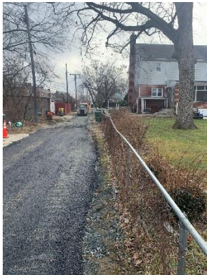
Dolfield-Copley Alley Sewer Work Completed. Temporary restoration in-place