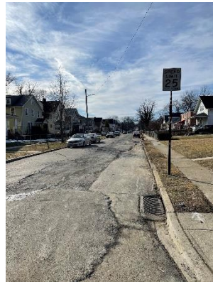
Temporary roadway stabilization after sewer construction at 3700 Blk of Belle Ave

We hope this provides insights for upcoming work as we strive to timely and safely complete this project. If you have any questions, please call (410) 396-4700, Monday through Friday, between 8:30 AM and 4:30 PM. Additional information and resources are also available on our website https://publicworks.baltimorecity.gov/ .