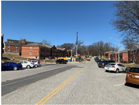
Micro-tunneling staging at 3910 Wabash Avenue

Below are some pictures to highlight work in-progress and recently accomplished: