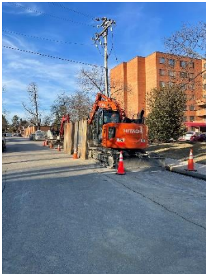
Sewer replacement work location at 3900 Blk of Callaway Avenue