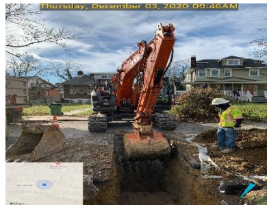
Sewer construction at 3800 block of Sequoia Avenue

We hope this provides insights for upcoming work as we strive to timely and safely complete this project. If you have any questions, please call (410) 396-4700, Monday through Friday, between 8:30 AM and 4:30 PM. Additional information and resources are also available on our website https://publicworks.baltimorecity.gov/ .