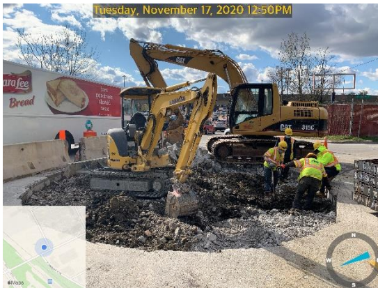
Microtunnel shaft construction starting at 3910 W Cold Spring Ln

Below are some pictures to highlight work in-progress and recently accomplished: