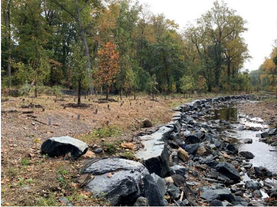
Tree, shrub, and grass planting in-progress along completed stream banks

Below are some pictures to highlight work accomplished to-date and in-progress.