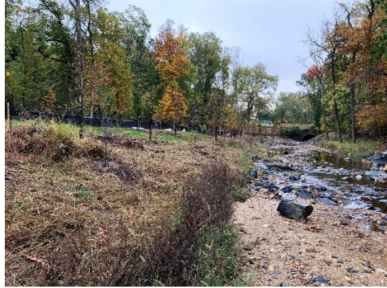
Tree, shrub, and grass planting in-progress along completed stream banks