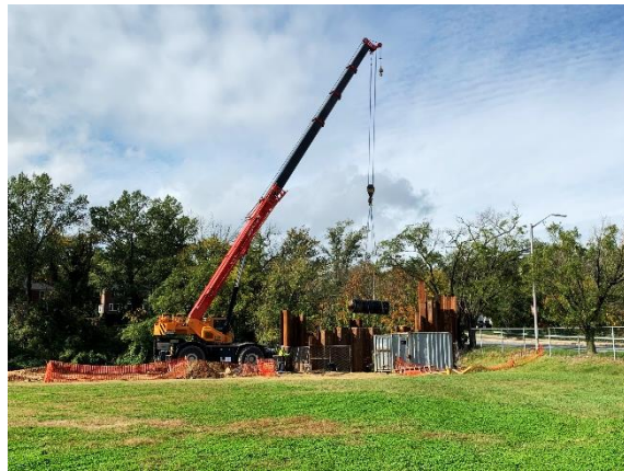
Tunneling operation from the surface at Northern Pkwy & Chinquapin Pkwy

We hope this provides insights for upcoming work as we strive to timely and safely complete this project. If you have any questions, please call (410) 396-4700, Monday through Friday, between 8:30 AM and 4:30 PM. Additional information and resources are also available on our website https://publicworks.baltimorecity.gov/ .