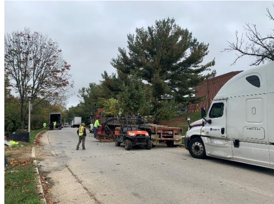
Tree and shrub deliveries for installation along stream banks between Woodbourne Ave & Belvedere Ave