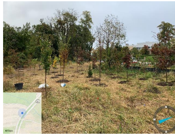
New tree grove installed along Hillen Road above the Chinquapin Run crossing

We hope this provides insights for upcoming work as we strive to timely and safely complete this project. If you have any questions, please call (410) 396-4700, Monday through Friday, between 8:30 AM and 4:30 PM. Additional information and resources are also available on our website https://publicworks.baltimorecity.gov/ .