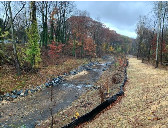
New plantings along the stream banks north of Hillen Road (Reach B)