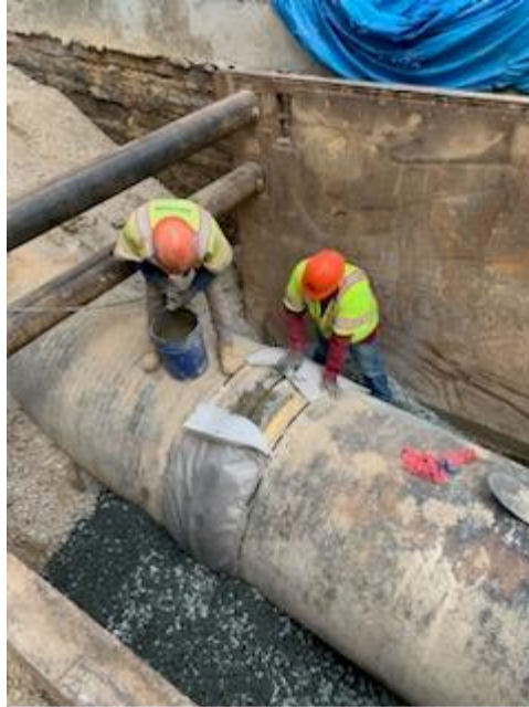
Figure 3-4: SC 941 - 48" Force main reinstallation on Rutland