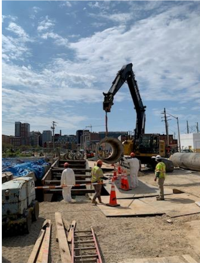
Figure 3-2: SC 941 - 48" Force main reinstallation on Rutland