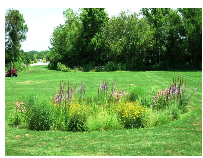
Stormwater Bumpout facility at Bush Street