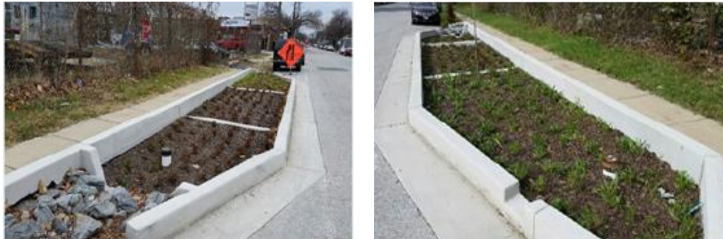
Stormwater Bumpout facility at Bush Street

Best Management Practices (BMPs) includes projects such as rain gardens, swales, bumpouts and micro-bioretentation facilities. They are planted areas that collect stormwater runoff from the adjacent paved street and allow the water to filter through the facility before flowing to a storm drain, which reduce the pollutants entering local streams and the harbor. Here is a sample picture of a BMP curb bumpout that is currently in design for your area.