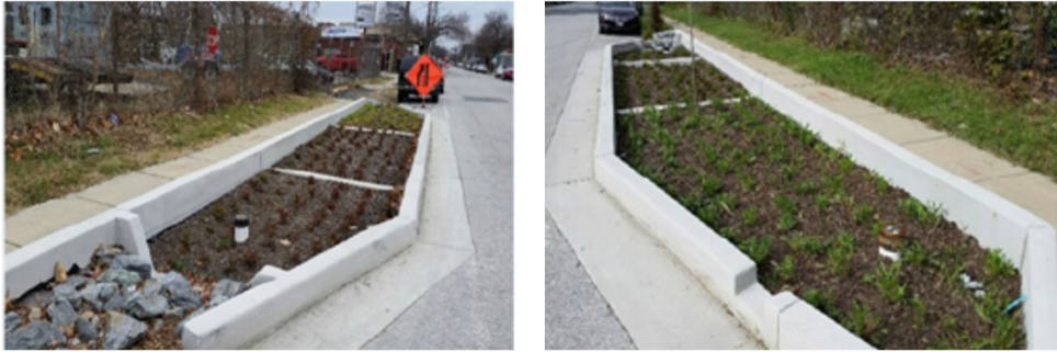
Stormwater Bumpout facility at Bush Street

Best management practices (BMPs) include projects such as rain gardens, swales, bumpouts and micro-bioretenion facilities. Bumpouts are planted areas that collect stormwater runoff from the adjacent paved street and allow the water to filter through the facility before flowing to a storm drain, which reduce the pollutants entering local streams and the harbor. Here is a sample picture of a BMP stormwater bumpout facility that is currently in design for your area.