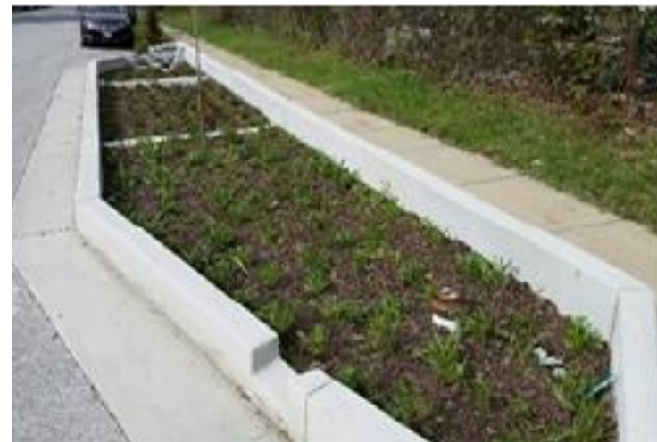
Stormwater Bumpout facility at Bush Street