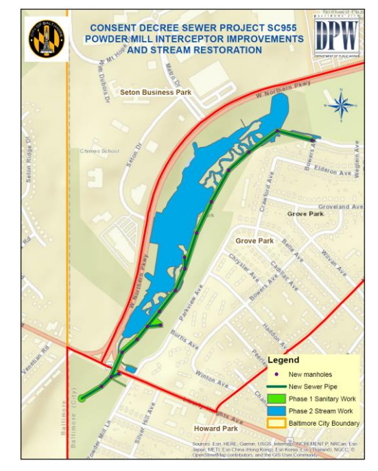
Figure 1: SC955 Phase I & II - Powder Mill Park