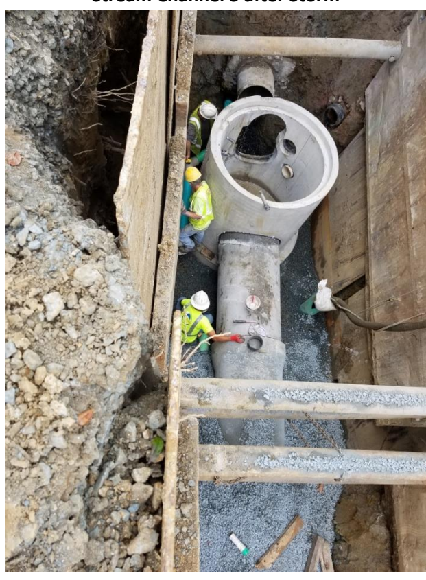
Installing Manhole S04KK1005MH