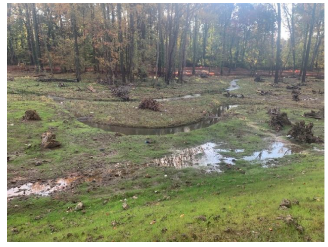
Stream Channel 3 after Storm