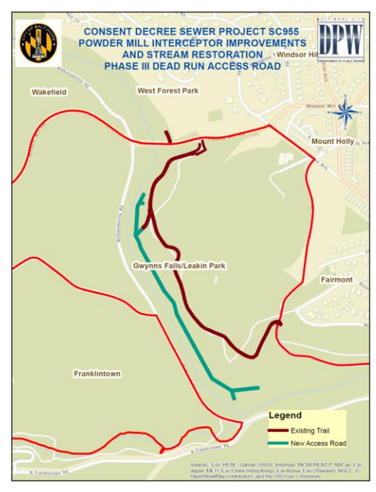
Figure 2: SC955 Phase III - Leakin Park