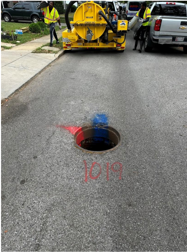
Figure 4-2: SC 1021 – Setting up for CCTV inspection