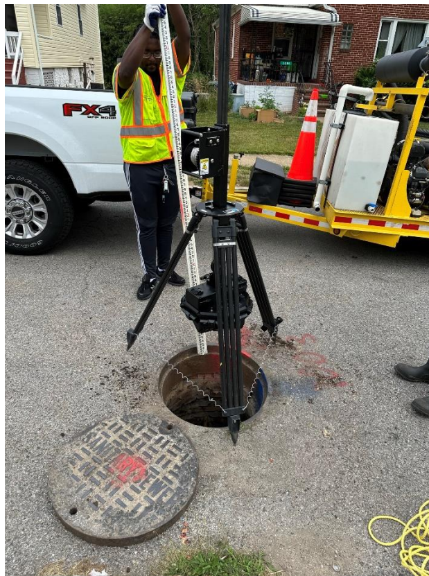
Figure 4-1: SC 1021 – CCTV inspection