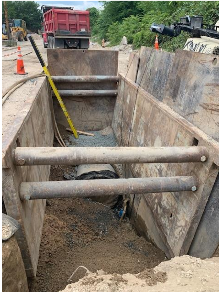
Figure 3-2: SC 941 – 48" Pipelaying Operation

Work is expected to be completed by October 2023.