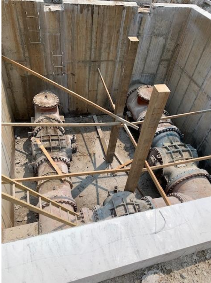
Figure 3-3: SC 941 – Prep for bypass tie-in