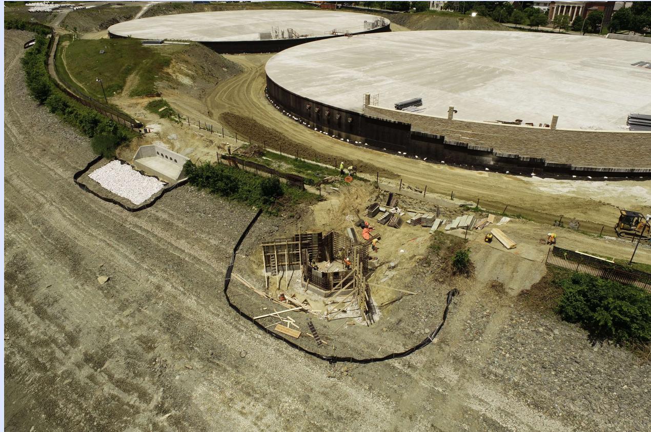
Tank A Overflow & Lake Overflow Structure Installation – 5/30/2024