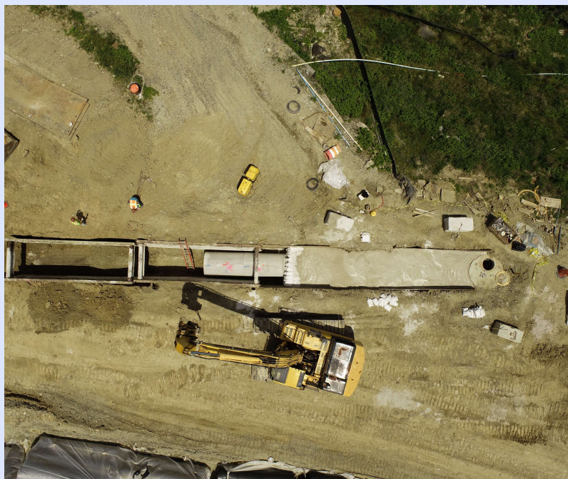
Installation of 48-inch Lake Overflow Piping – 5/30/2024

➤ Distribution building work completed: 99%