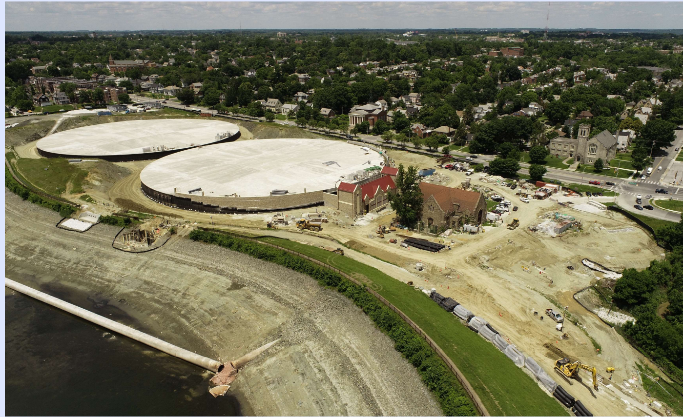
Site Construction – 5/30/2024