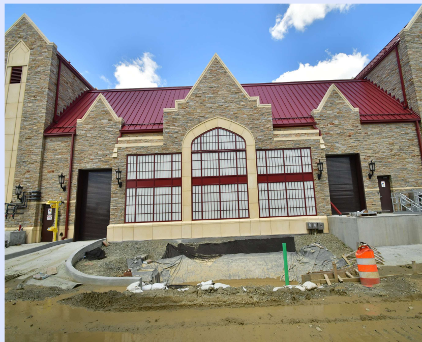
Distribution Building Under Commissioning – 5/30/2024

➤ Distribution building work completed: 99%