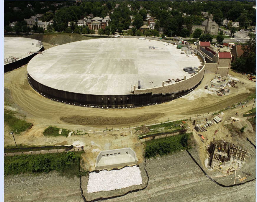
Tank A with Damp Proofing/Stone Veneer, Tank A Overflow, and Lake Overflow Work Continuing— 5/30/2024