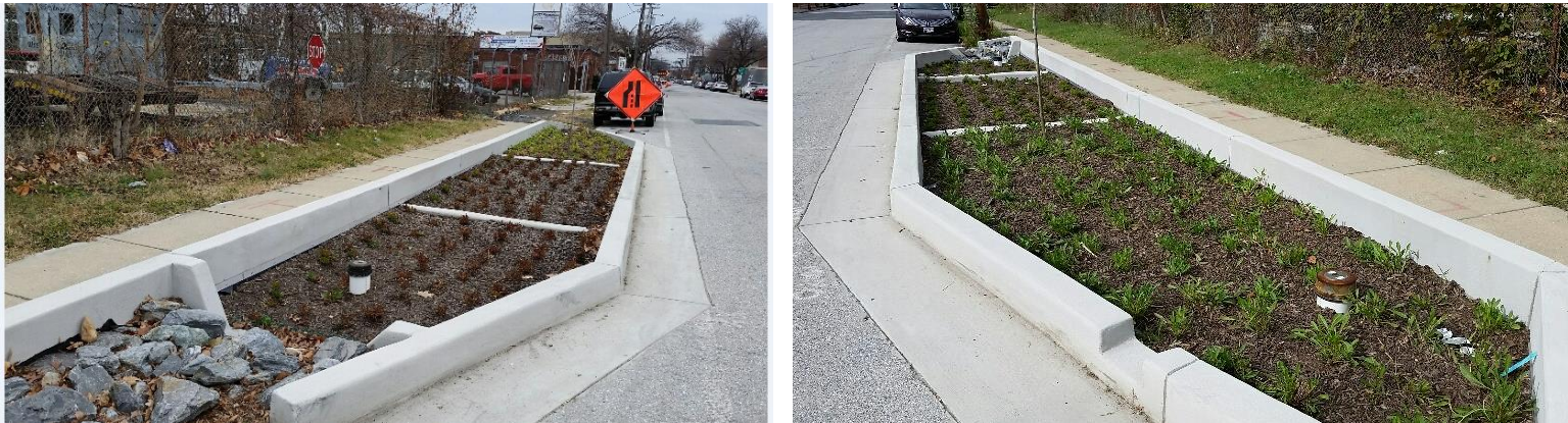
Stormwater Bumpout Facility at Bush Street

Best Management Practices (BMPs) such as rain gardens, swales and micro-bioretenion facilities. They are planted areas that collect stormwater runoff and allow the water to filter through the facility before flowing to a storm drain, reducing the pollutants entering local streams and the harbor. Here is a picture of a BMP curb bumpout that is currently in design for your area.